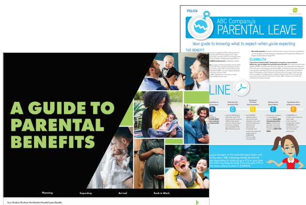
Parent Support eGuide & Infographic