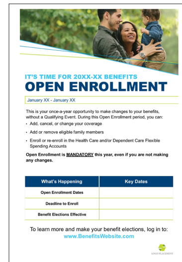
Open Enrollment Communications