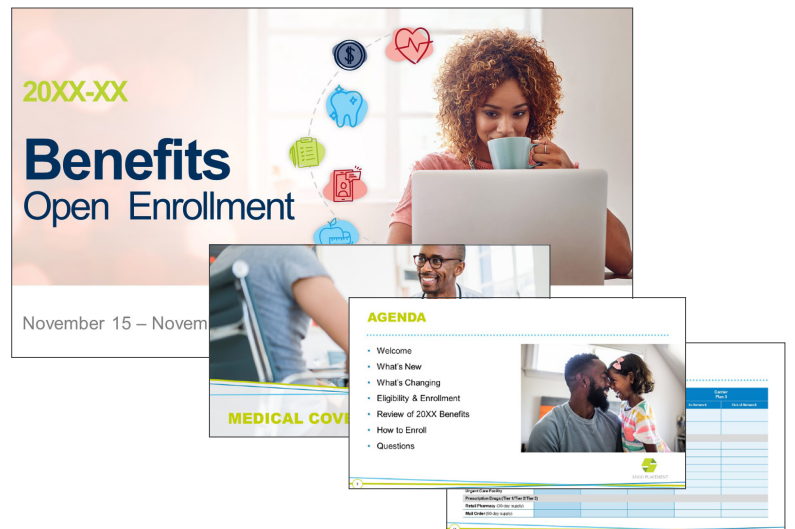
Revamped Open Enrollment Brainshark Deck