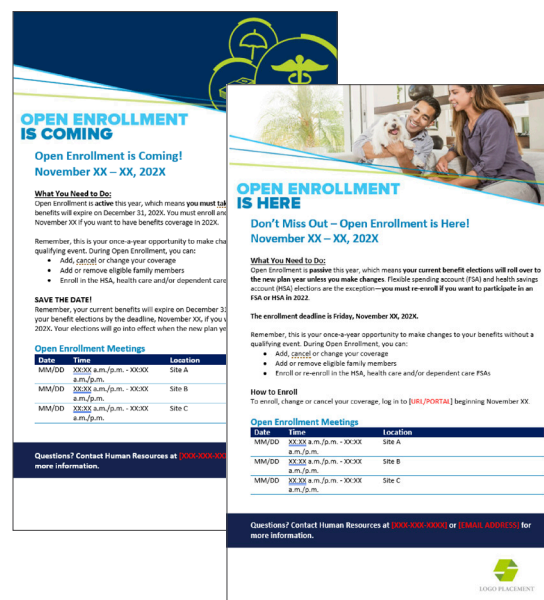
New DIY Open Enrollment Emails