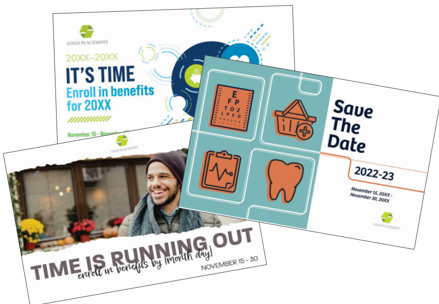
Open Enrollment Postcard Messaging Options (OE is coming, OE is here, OE is ending)