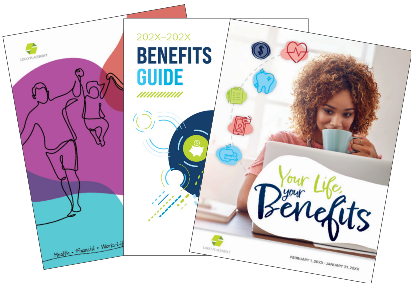
New Benefit Guide Covers